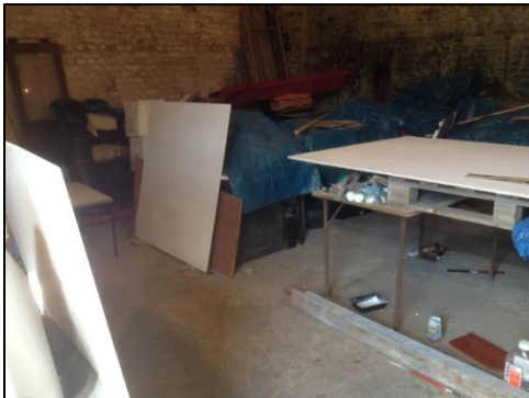
New display boards in the making

Unfortunately, when quotations were received, it was immediately apparent that the cost was going to be far in excess of the funds available so it is now back to Plan A which is for the interior of the lantern to be constructed by the ALK team. On reflection, although it will take a good deal longer to complete, the construction will be largely of wood and therefore much easier to work with to take account of any little measurement errors and tweaks that might be needed. This is all now in the planning stage and work will start shortly on the frame for the mezzanine floor and steps up to it.