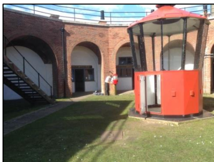
Nab Tower lantern with some maintenance going on in the background

The Nab Tower lantern has progressed as far as we can go for the moment. The putting together of the structure is complete and new glazing installed. We are now thinking of the interior and had what we thought was a good idea. We would ask a local metalwork company to make the floor structure, steps, pedestal for the optic and other associated bits and the ALK team would install it and do the finishing off.